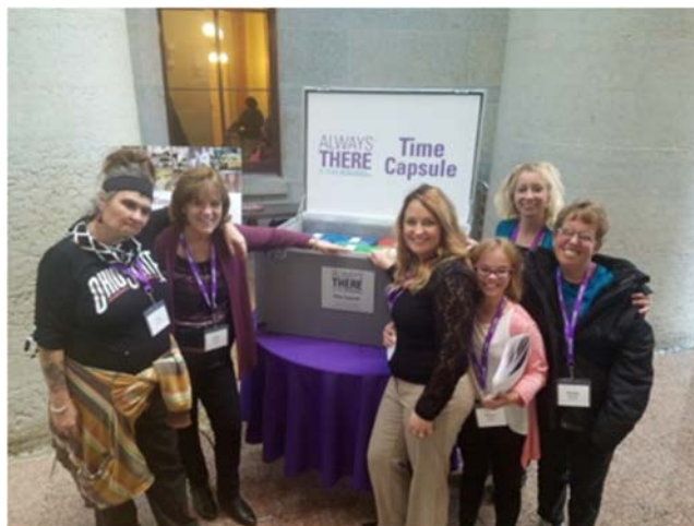
Representing Shelby County at the Always There Celebration of 50 years of Shelby County Boards in Columbus, OH.